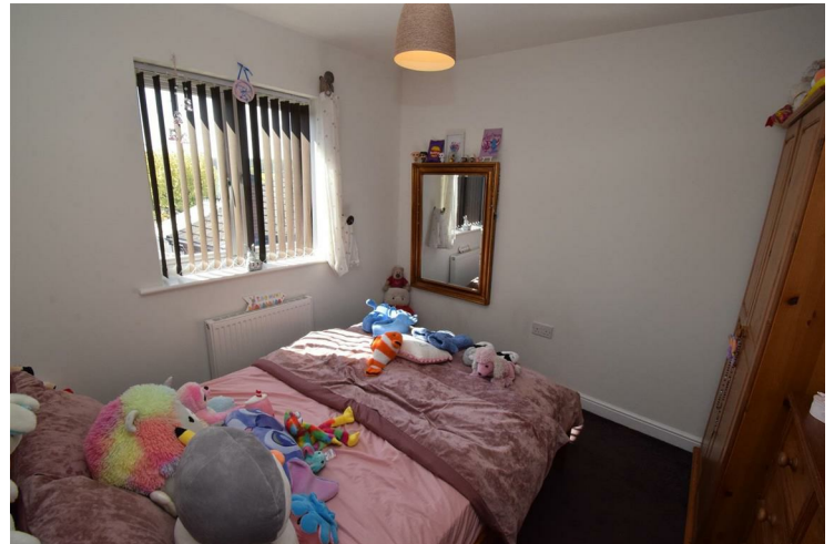
Bedroom 3 9'11" x 8'9" (3.03 x 2.67)

Third double bedroom with a radiator and double glazed rear window.