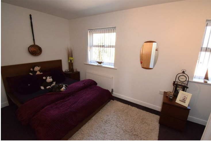
Master Bedroom 15'3" > 11'10" x 8'0" (4.66 > 3.63 x 2.46)

With two sets of fitted wardrobes, two double glazed front windows, a radiator and an over stairs airing cupboard which houses the hot water cylinder. Door to: