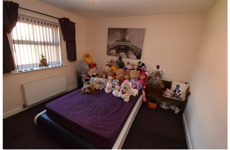
Bedroom 2 11'6" x 10'7" (3.52 x 3.25)

Measurements include the wardrobes. Second double bedroom with fitted floor to ceiling wardrobes, a radiator, access to the loft space and a double glazed front window.